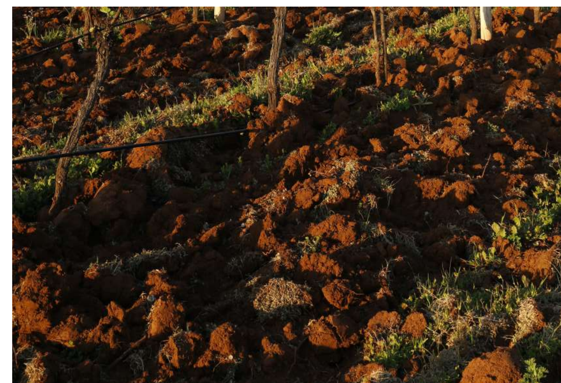
Tres Esquinas has red clay-loam soils.