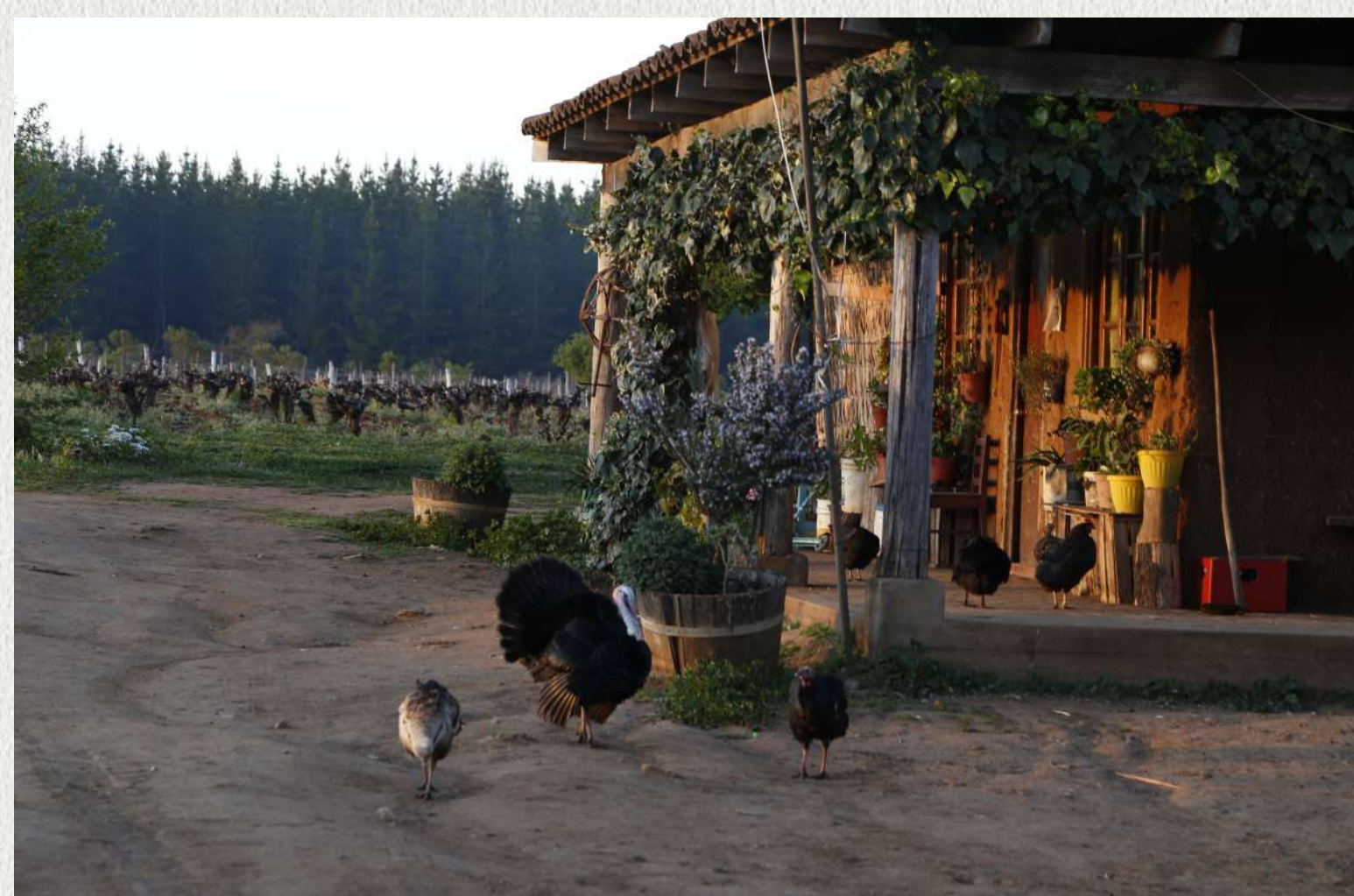
Tres Esquinas farm house, Cauquenes.